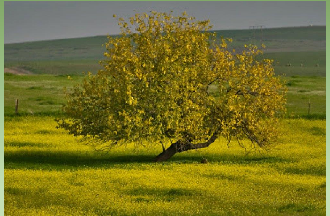
Mustard seed and Mustard tree